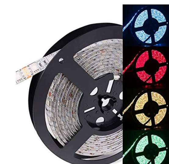
Waterproof LED tape